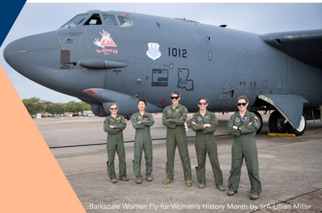
Barksdale Women Fly for Women's History Month

Develop: Maintaining organizational sustainability, transparency, and growth so that SWAN can continue its mission, increase its impact, and promote more equal and just military and veteran systems.