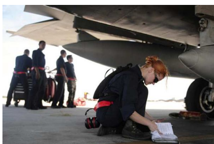
The Invisible War

This weekend marked an important step toward the elimination of sexual assault in the military. The Invisible War , a documentary film featuring the stories of survivors and the work of SWAN and other advocates, had its world premiere at the Sundance Film Festival. SWAN staff provided technical assistance in the development of the film and attended the premiere. Oscar nominated Director Kirby Dick ( Outrage, Twist of Faith ) told the press that the work he did on this film consisted of "the most